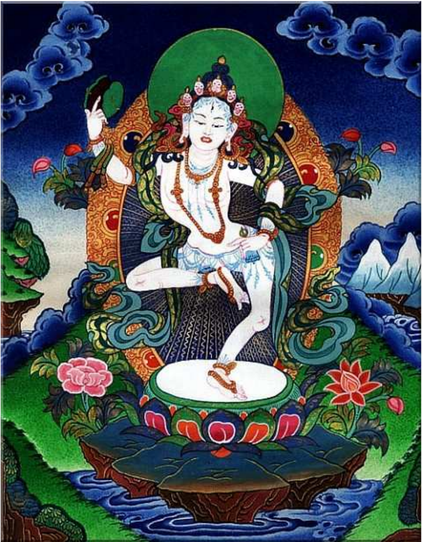
Thangka of Machig Labdron